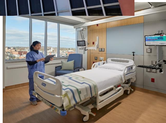
Post Graduate Year Two